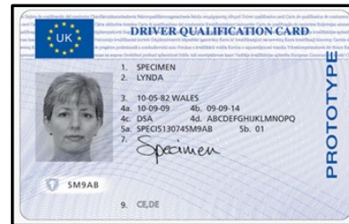
Driver Qualification Card

Most of the forms of ID listed above will satisfy this requirement; however, if a passport is presented, the trainer will need to verify that the driving licence number provided is accurate.