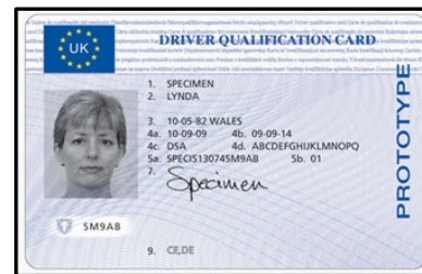
Driver Qualification Card

Most of the forms of ID listed above will satisfy this requirement; however, if a passport is presented, the trainer will need to verify that the driving licence number provided is accurate.