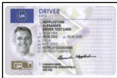
Digital Tachograph Card